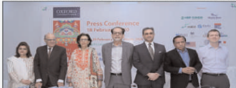
A group of people, including organizers and authors, are gathered for a press conference for the Karachi Literature Festival.

Karachi (19 Feb 2020): The much-awaited Karachi Literature Festival (KLF), organized by Oxford University Press, is all set to celebrate its 11th edition this year from 28 February