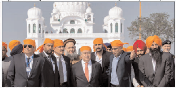
pollution is the biggest issue. He also emphasized on dialogue between institutions. Later, he also wrote his comments in the guest book. Earlier in the day, United Nations (UN) Secretary-General Antonio Guterres had said despite inner problems Pakistan extended its support to Afghan refugees. "Afghan refugees are being

for negotiations but that is only possible when the both sides agree," he said while urging that the peace can only be that the peace can