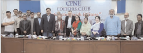
CPNE EDITORS CLUB meeting with Editors.

KARACHI: February 19, 2020. The safety and economic condition of journalists deteriorating globally but Pakistan is facing more innovative by initiating new economic models for survival. "Pakistan has some good laws but lack of implementation media in the country. He said CPNE had challenged anti media freedom actions of rulers and would