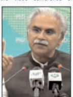
#SAARC member countries on the issue,' FO Spokesperson Aisha Farooqui said. Farooqui's response came hours after Prime Minister Modi extended his offer. 'I would like to propose that the leadership of SAARC nations chalk out a strong strategy to fight Coronavirus. We could discuss, via video conferencing ways to keep our citizens healthy. Together, we can set an example to the world, and contribute to a healthier planet,' he had tweeted. Various media reports observed that Prime Minister Modi's offer was unexpected given the fact that his government

'The threat of #COVID-19 requires coordinated efforts at [the] global and regional level. We have communicated that SAPM on Health will be available to participate in the video conference of