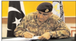
Staff (COAS), General Qamar Javed Bajwa, an Inter Services Public Relations (ISPR) press release said.

The meeting to this regard was held here at General Headquarters which was presided by Chief of Army