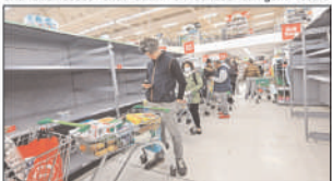
indefinitely, millions of travellers barred from crossing borders, celebrities and politicians become infected and the whole of Italy locked down ended with a flurry of announcements.

A week that saw schools and businesses shut down