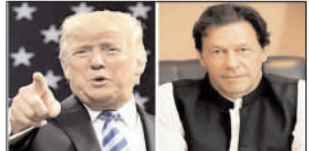
ing a press conference in the Indian capital on the last day of his two-day visit, after holding meetings with the Modi administration.

However, when pressed further by another reporter about India's past rejection of his offer, the publication quoted Trump as saying: "I didn't say anything about that [being a mediator], Kashmir obviously is a big problem between