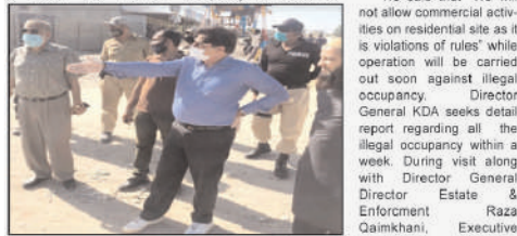
Town Korangi while Executive Engineer Korangi briefed Director General KDA regarding all the steps which are being taken for eviction of illegal occupancy. On that occasion he said that 'We will not allow commercial activities on residential site as it is violation of rules' while operation will be carried out soon against illegal occupancy.